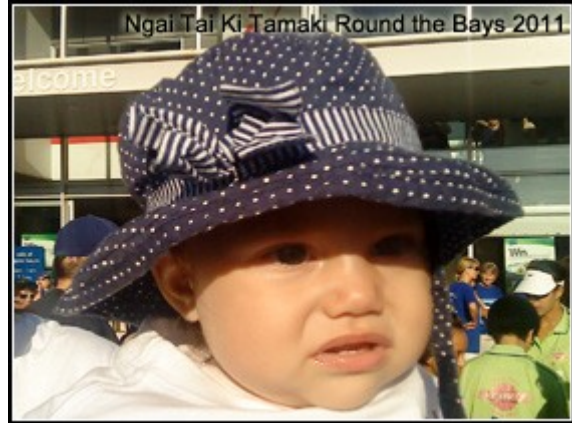
Ngai Tai Ki Tamaki Round the Bays 2011