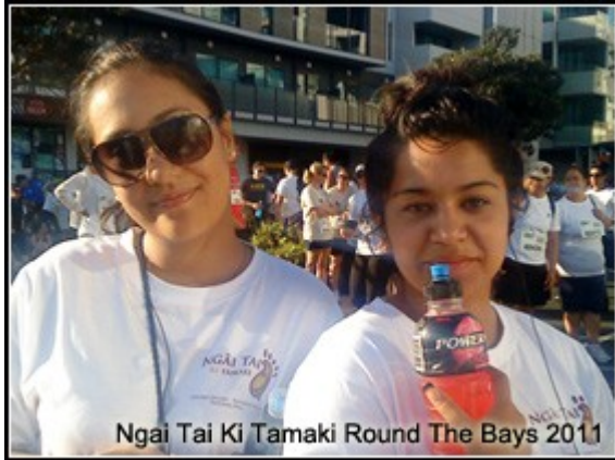
Warm-ups before the start

This year Ngai Tai Ki Tamaki has been promoting whanaungatanga, kotahitanga and good health and well-being within the iwi. It was with this in mind that we entered a team in the Round the Bays Fun Run 2011. And what a great day we had. We had over 60 team members and support crew and of those at least 40 registered runners on the day. The proceeds from the event went to several very worthy causes.