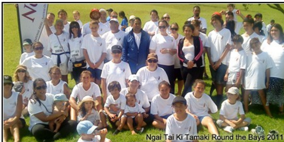
Ngai Tai Ki Tamaki Round the Bays 2011

A BIG THANK YOU TO THE EVENTS TEAM, SUPPORT CREW AND PARTICIPANTS FOR MAKING THIS A GREAT DAY OUT FOR NGAI TAI !!!