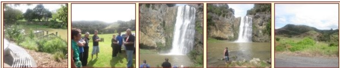
The wonderful scenery around The Wairoa river, Ness Valley, and Hunua Falls

Our hui-a-iwi are always advertised on our website http://www.ngaitai-ki-tamaki.co.nz . This is the best way to stay up to date with the latest news, hui, documents for download and up and coming events. Also registration forms are here for whanau to fill out. We hope to see as many whanau members as possible at our next Hui-a-Iwi in May. Check below for full details as we continue to visit sites of significance to the people of Ngai Tai ki Tamaki.