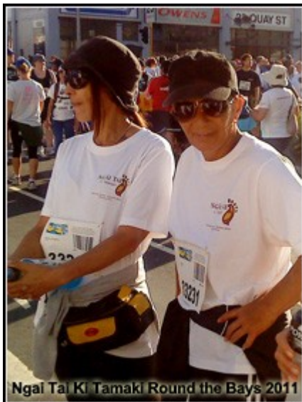
Ngai Tai Ki Tamaki Round the Bays 2011