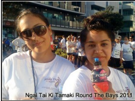
Ngai Tai Ki Tamaki Round The Bays 2011

This year Ngai Tai Ki Tamaki has been promoting whanaungatanga, kotahitanga and good health and well-being within the iwi. It was with this in mind that we entered a team in the Round the Bays Fun Run 2011. And what a great day we had. We had over 60 team members and support crew and of those at least 40 registered runners on the day. The proceeds from the event went to several very worthy causes.