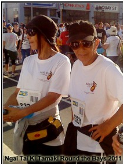
Whaea ready for the race...

We had walkers, runners, pram pushers and even a couple of bladers. The weather was magical and so was the scenery around Tamaki Drive. There isn't a better way to spend a Sunday morning than walking the whenua with the sun shining on your face.